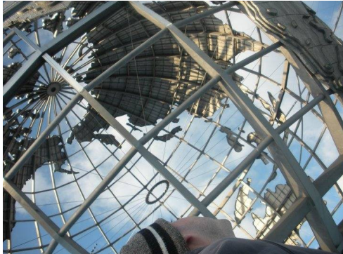
The picture is of the Unisphere, which was built for the 1964-1965 New York World's Fair, and is located at Flushing Meadows - Corona Park in Queens, New York City.